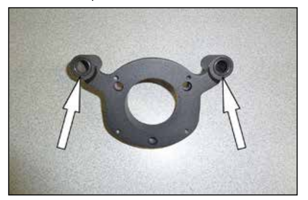
8. Install the remaining two o rings onto the front of the back plate as shown.