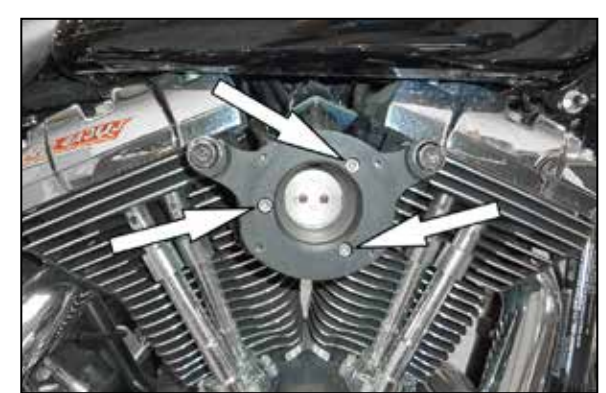
10. Install the provided gasket between the throttle body and back plate use the provided hardware to secure the back plate to the throttle housing. Tighten the crankcase breather bolts.

NOTE: On applications that have had the support bracket removed, install the two provided spacers between the back plate and cylinder head at the breather holes and then install the breather bolts as shown.