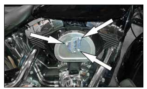
3. Remove the three air filter retaining bolts as shown.