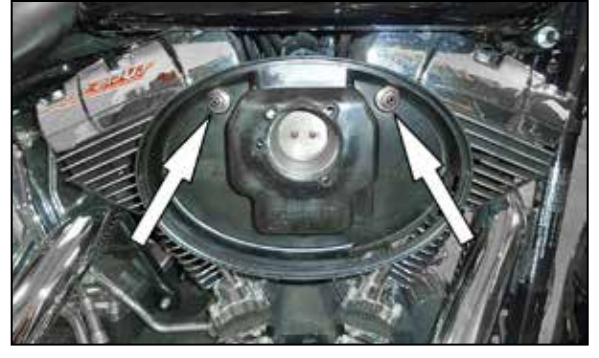
5. Remove the two crankcase bolts as shown