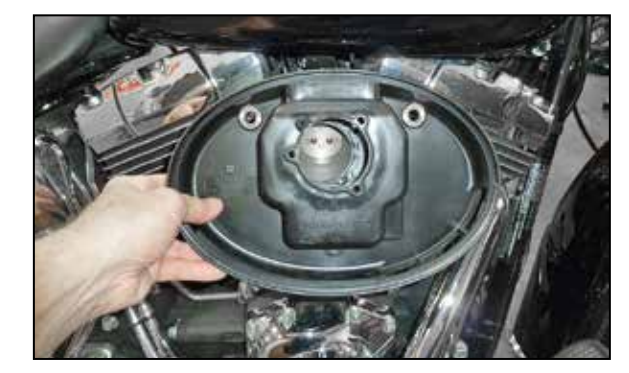
6. Remove the air filter breather base as shown. NOTE: K&N Engineering, Inc. recommends that customers do not discard the factory air intake components.