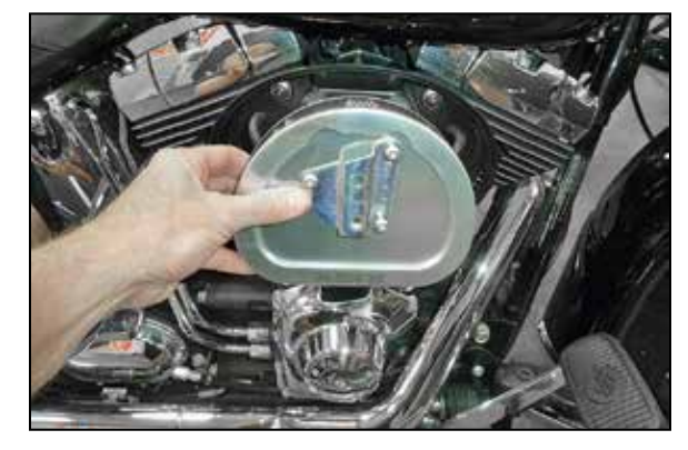
Remove the air filter with breather hoses as shown.