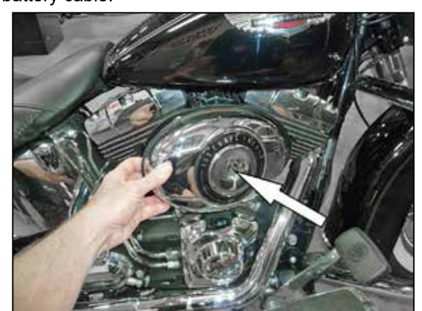
2. Remove the air filter cover retaining bolt and then remove air filter cover as shown.

1. Turn off the ignition and disconnect the negative battery cable.