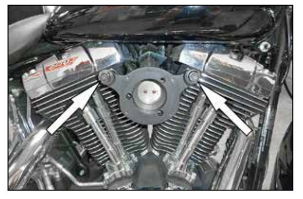
9. Using the two provided crankcase breather bolts install the back plate onto the vehicle as shown. Do not tighten the breather bolts at this time.

NOTE: On applications that have had the support bracket removed, install the two provided spacers between the back plate and cylinder head at the breather holes and then install the breather bolts as shown.