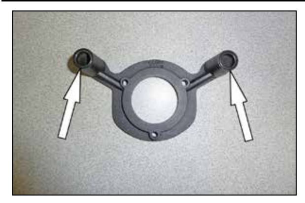
7. Install two o rings provided onto the back side of the K&N® back plate as shown.